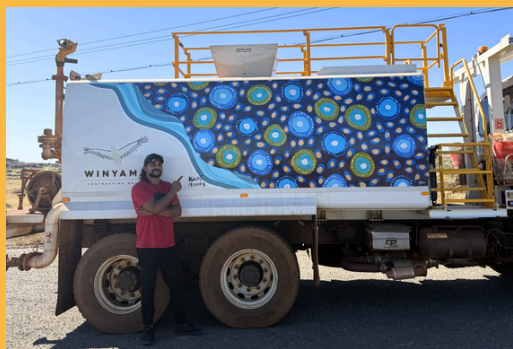
Kade Moody licensing deal