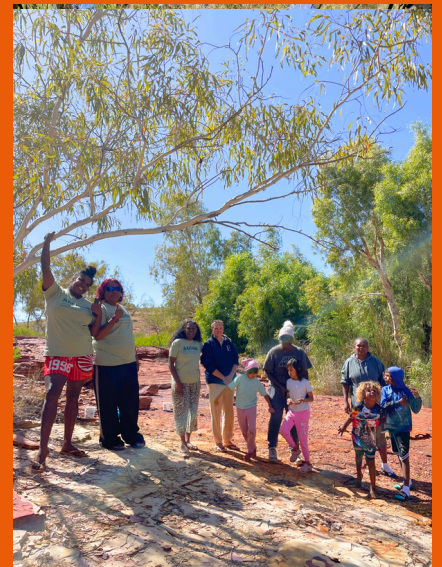
Artists & the grannies.