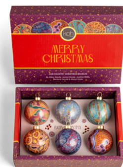
KOH Living merchandise