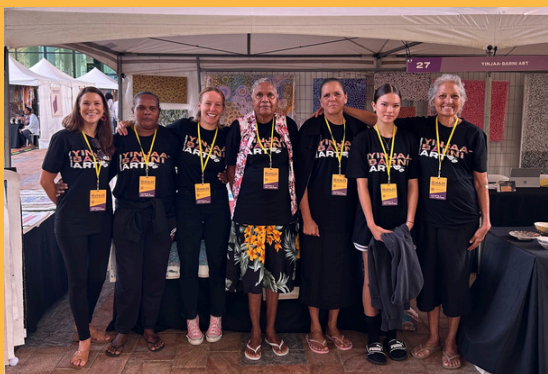
Team at Reveled Art Market