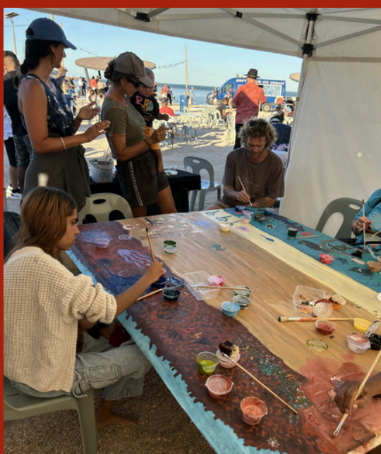
Murujuga Community Canvas