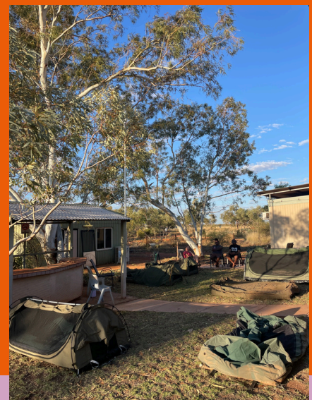
Swag camp life at beautiful Millstream, Yindjibarndi Country.