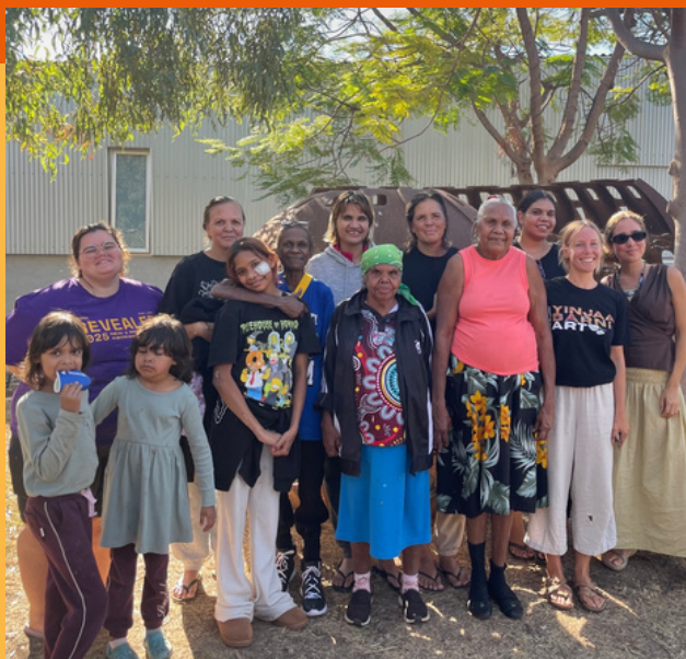
Spinifex Hill & YBA mob

It was a valuable gathering that strengthened connections across the Aboriginal arts community and supported our shared futures.