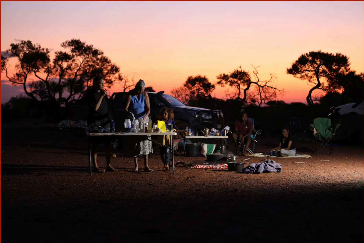
Return-to-Country camp for the Sandy family for Melissa Sandy's The Void exhibition documentary .